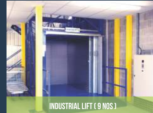
INDUSTRIAL LIFT ( 9 NOS )

Businesses tend to scale from small to large. If you are thinking of expanding your business or starting a new venture then this is an opportunity knocking on your door. Ratna Biz Park is equipped with all modern amenities needed to run a safe and smooth business. With so many facilities, it is the best place to set the right impression for your business.