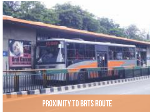
PROXIMITY TO BRTS ROUTE