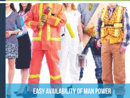
EASY AVAILABILITY OF MAN POWER