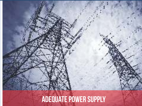
ADEQUATE POWER SUPPLY