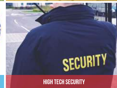
HIGH TECH SECURITY