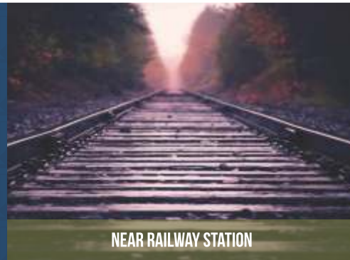
NEAR RAILWAY STATION