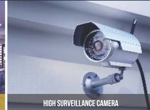
HIGH SURVEILLANCE CAMERA