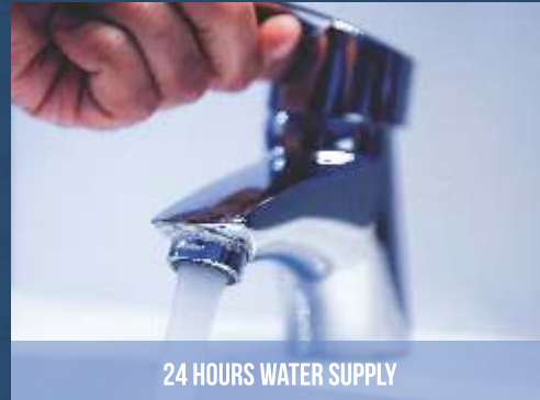
24 HOURS WATER SUPPLY